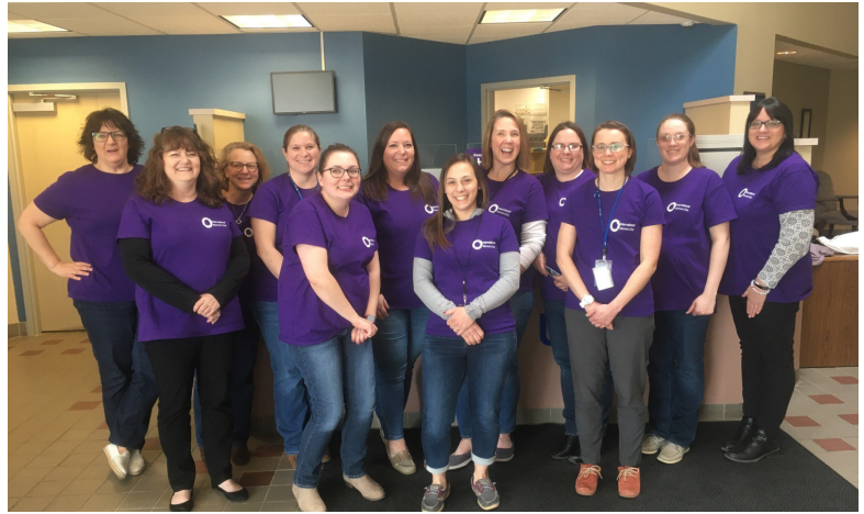
Employees wore purple t-shirts to show support on International Women's Day.