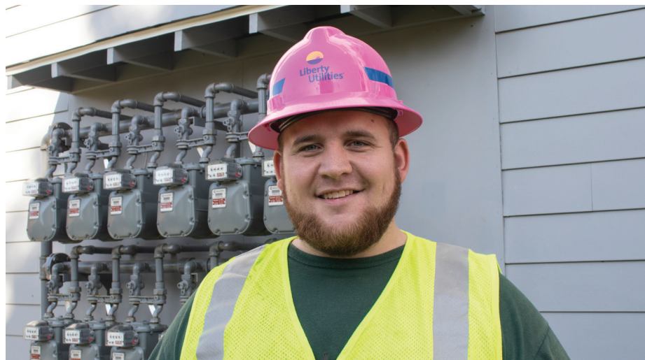
Liberty field employee showing his support for breast cancer awareness month.